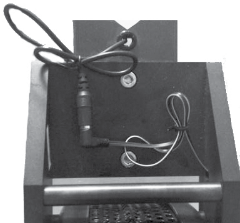
BACK OF THE FLYWHEEL

Secure the excess wire with the cable "ties" provided. When connected, this cable allows data transfer from the flywheel to the onboard console. (See image 1 & 3.)